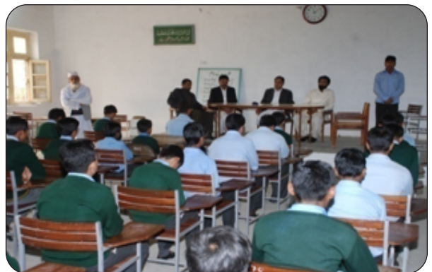
On 13 th Feb 2014, Police Station ANF Attock organized a lecture at Govt. Higher Secondary School for Boys Attock