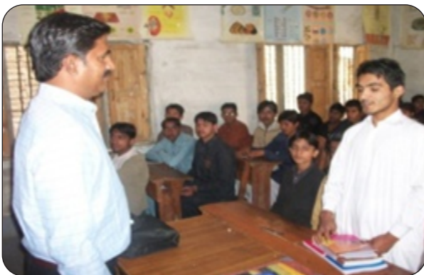
On 31 st Jan 2014, RD ANF Karachi organized a lecture at Govt. Bhattai High School Kandhkot