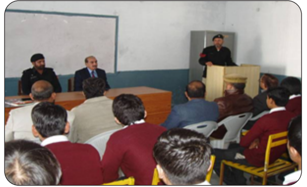
On 28th January 2014, lecture arranged by PS ANF Haripur at "Hazara Public School and College, Haripur".