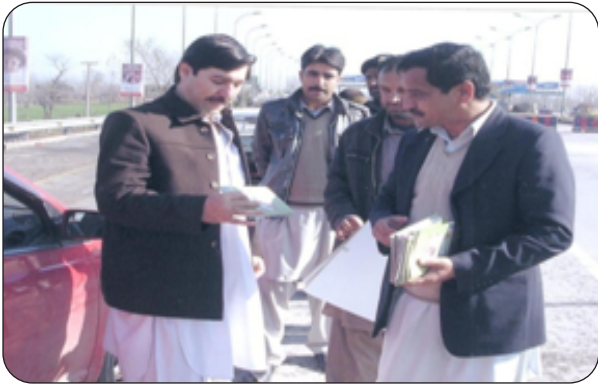
On 7 th Feb 2014, Distribution of ANF Pamphlets and Posters” was arranged by PS ANF Peshawar at Peshawar Motor Way Tool Plaza.