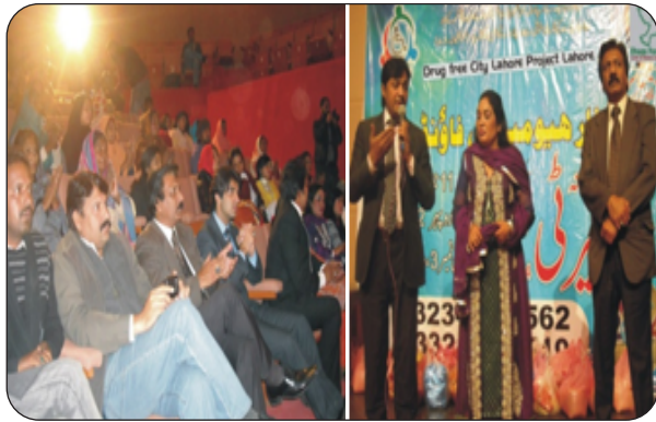
On 11 th Feb 2014, A musical-cum-awareness show was organized by Ehsas for Life at Al-Hamra Art Centre, Lahore