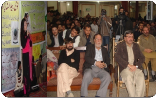
On 29th Jan 2014, a musical show was arranged by Quami Bedari Parcham in collaboration with RD ANF Peshawar in Khushal Hall Wedding Hall Peshawar.