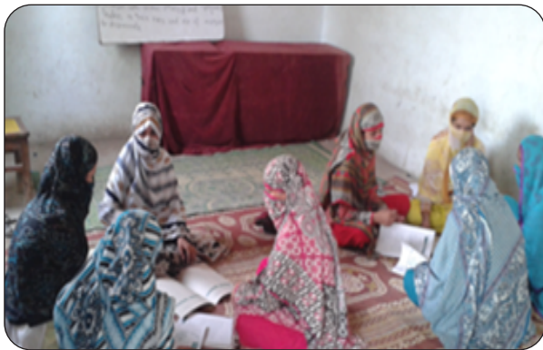
On 18 th March 2014, one day training program (workshop) was arranged by "Hamdard Community Development Program" in Hamdard Model School Mamash Khel Bannu,