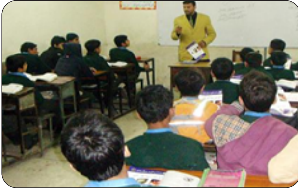
On 22.Jan.2014, A lecture was organized at Muslim League High School, Davis Road, Lahore