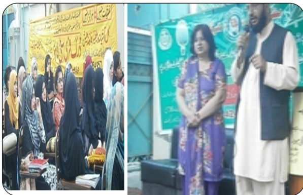
On 12 th March 2014, A lectures was organized at IBL College, Girls Campus, Samanabad, Lahore