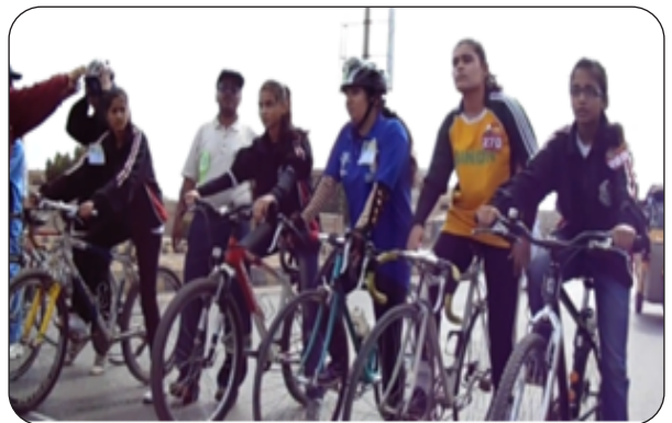
On 2 nd March 2014, RD ANF Karachi organized a cycle race (Female) at Sea view Road DHA Karachi