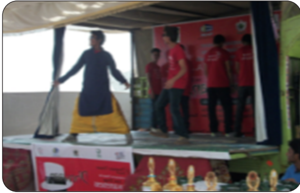
On 2nd March 2014, RD ANF Karachi organized a Anti Narcotics Awareness Theater "Play Dhuwaan" at Karachi