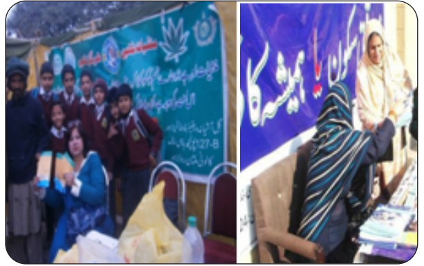
On 21 st Jan 2014, camps organized at Chauburgi, Gulshan-e-Ravi, Nisbat Road, and Chowk Samanabad, Lahore.