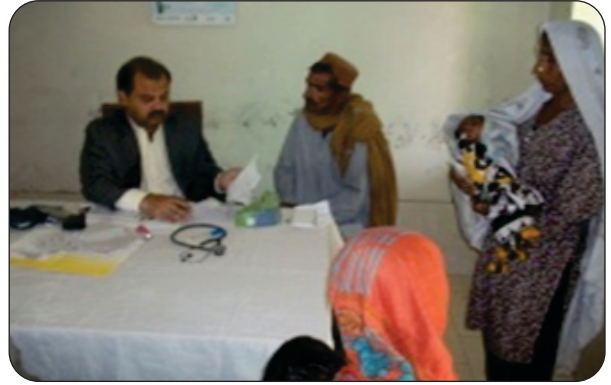
On 31 st Jan 2014, RD ANF Karachi organized a free medical camp at kandhkot