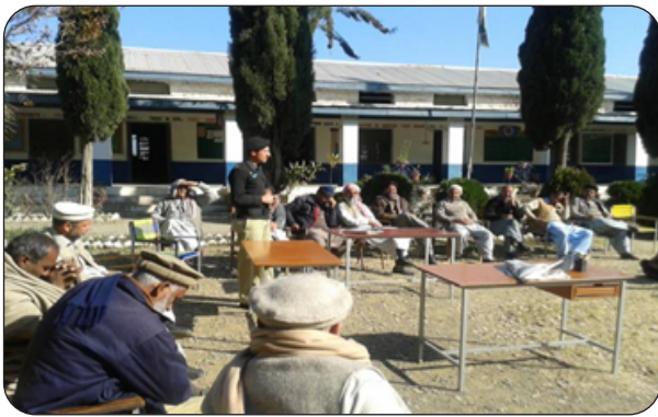
On 2nd Jan 2014, Lecture was arranged by PS ANF Haripur at Valley Lyceum School Gudwalian, Haripur