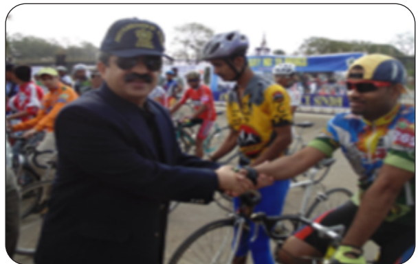
On 2 nd March 2014, RD ANF Karachi organized a cycle race (Male) from Mazar-e-Quid to Sea View DHA Karachi