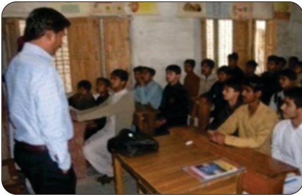
On 30 th Jan 2014, RD ANF Karachi organized a lecture at Govt. Mehran High School Kandhkot