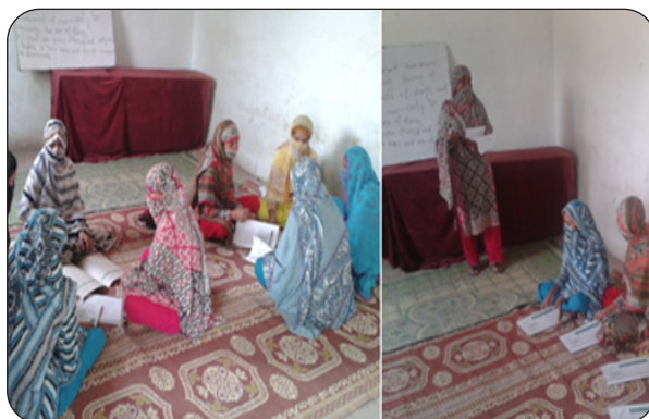
On 18th Jan 2014, A seminar was organized at Punjab Law College, Muslim Town, Lahore