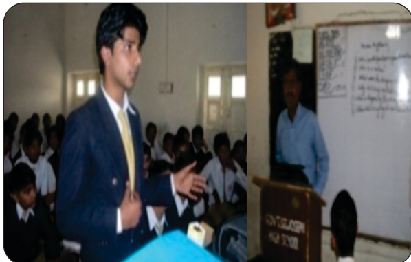
On 29 th Jan 2014, RD ANF Karachi organized a lecture at Govt. Saint Joseph High School Larkana