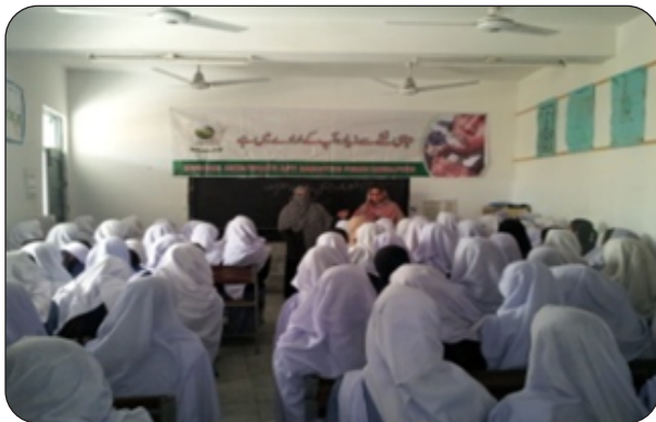
On 13 Feb 2014, RD ANF Rawalpindi organized a lecture at Islamabad Model School for Girls Thanda Pani