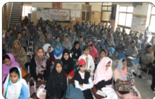
On 16 th Jan 2014, A Seminar was organized at Government Girls High School, G.T. Road, Faiz Bagh, Lahore