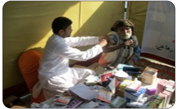
On 29th Jan to 30th Jan 2014, RD ANF Karachi organized a free medical camp at Larkana