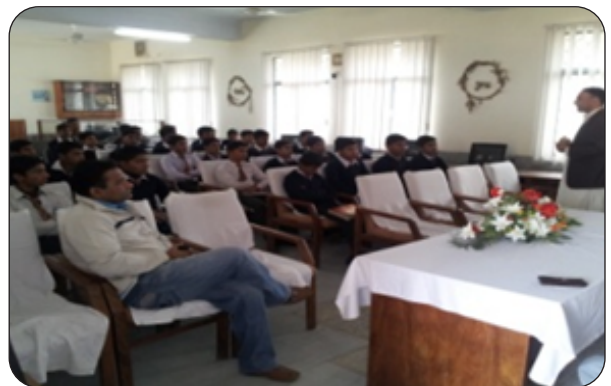
On 5th Feb 2014, RD ANF Karachi organized a lecture at Islamabad Model School for Boy Thanda Pani