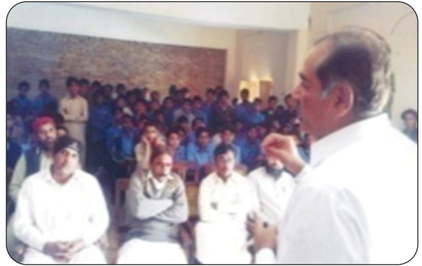
On 30th Jan 2014, RD ANF Karachi organized a lecture at Govt. Boys High School Sehwan Shareef