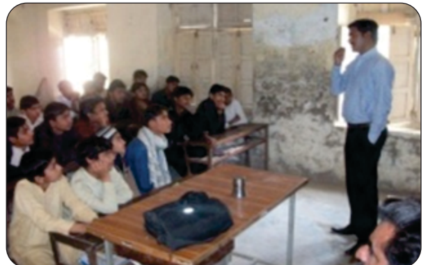
On 29 th Jan 2014, RD ANF Karachi organized a lecture at Govt. Elementary School Larakan