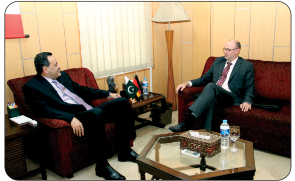
25 Feb 2014-German DLO