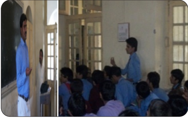
On 28th Jan 2014, RD ANF Karachi organized a lecture at Govt. Pilot Higher Secondary School at Larkana