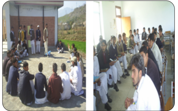
On 11th March 2014, lecture was organized by Abaseen Social Welfare Organization in the Government College District Malakand,