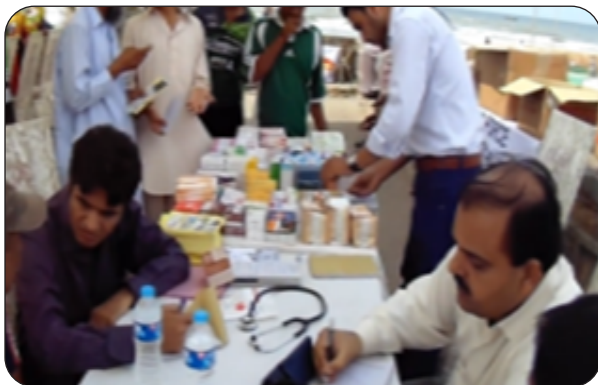
On 2 nd March 2014, RD ANF Karachi organized a free medical camp at Sea view DHA Karachi