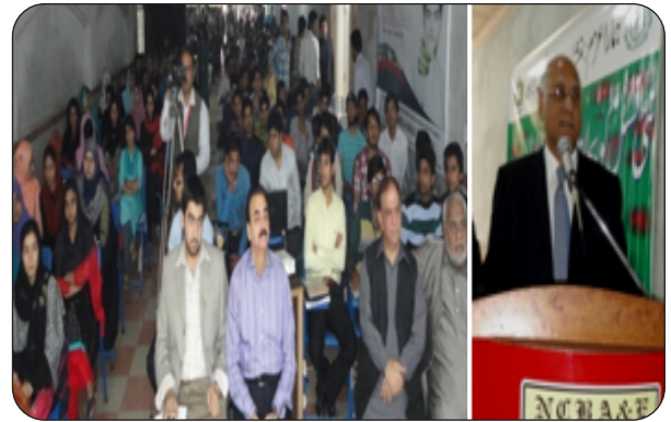
On 17 th March 2014, A seminar was arranged by the Project Management at National College of Business Administration and Economics, Bata Pur, Lahore