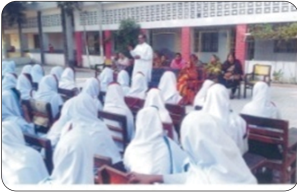
On 30th Jan 2014, RD ANF Karachi organized a lecture at Govt Girls Higher Secondary School Sehwan Shareef