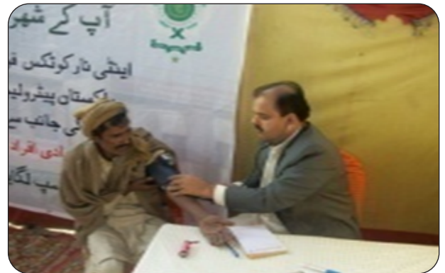
On 27th Jan to 28th Jan 2014, RD ANF Karachi organized a Free Medical Camp at Sehwan Shareef, Sindh