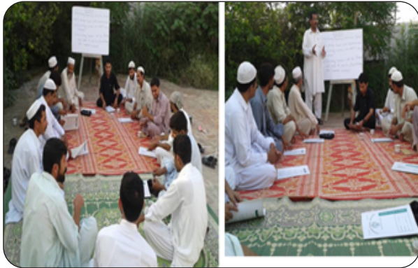
On 10 th March 2014, one day training program (workshop) was arranged by "Hamdard Community Development Program" in Hamdard Model School Mamash Khel Bannu,