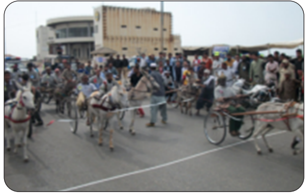
On 2 nd March 2014, RD ANF Karachi organized a Donky Derby Race at Sea view Road DHA Karachi