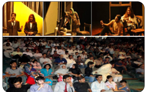
24 th to 29 th March 2014, An entertainment-cum-awareness show was organized by Ehsas for Life for at Al-Hamra Art Centre, The Mall, Lahore